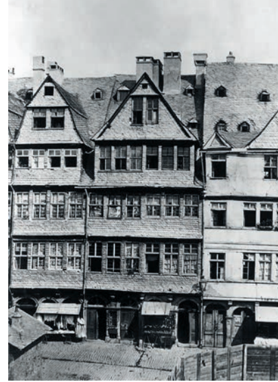
Above: The Rothschild House in the Frankfurt Ghetto, c 1874; photo: Waddesdon (National Trust); gift of Dorothy de Rothschild, 1971. Left: Rothschild Family Coat-of-Arms; photo courtesy of Liliane de Rothschild.